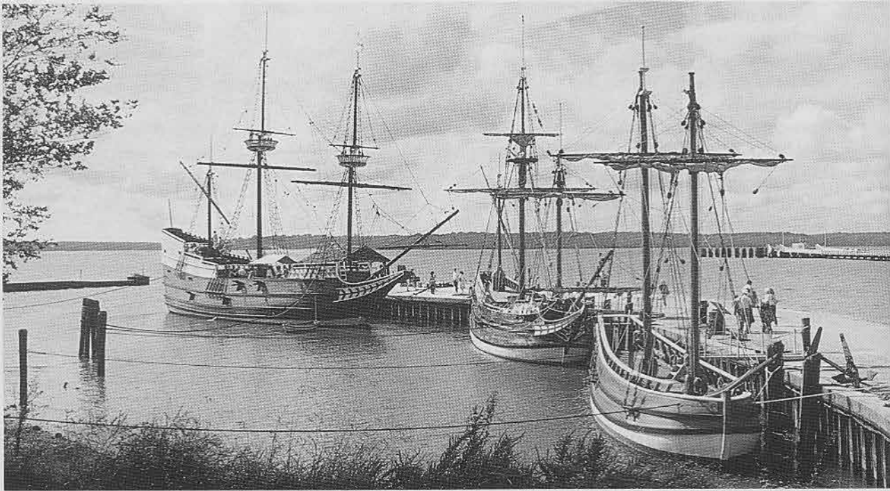
Replicas of the ships that carried the first settlers to Jamestown in 1617.

All through the night the storm blew the three small ships northwards. For hours the frightened sailors struggled with wet ropes and snapping canvas sails. At last, as dawn colored the eastern skies, the storm came to an end. Men dropped to the decks, exhausted. Some fell asleep. Excited shouts awoke them. "Land! Land!" The sailors rushed to the sides of the ships. There, at last, was the land for which they had been searching – Virginia. It was the morning of April 26 in the year 1607.