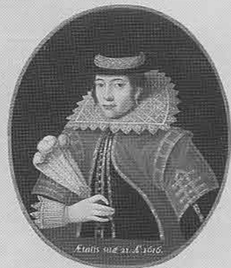
A portrait of Pocahontas, painted during her visit to London.

In 1609 Smith was badly injured in a gunpowder explosion and was sent back to England. Five years later, in 1614, Pocahontas married the tobacco planter John Rolfe. In 1616 she travelled to England with him and was presented at court to King James I. It was there that the portrait you see here was painted. Pocahontas died of smallpox in 1617 while waiting to board a ship to carry her back to Virginia with her newborn son. When the son grew up he returned to Virginia. Many Virginians today claim to be descended from him and so from Pocahontas.