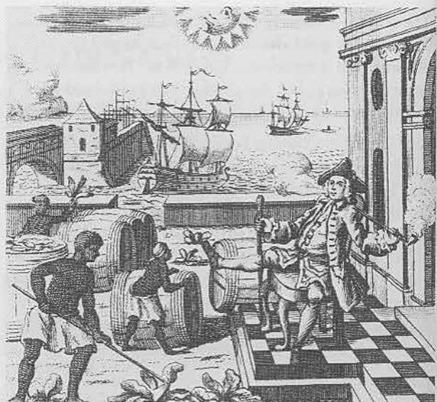
A label from Wills tobacco. Wills was one of the most famous English tobacco companies.

Soon most of the Virginia settlers were busy growing tobacco. They cleared new land along the rivers and ploughed up the streets of Jamestown itself to plant more. They even used it as money. The price of a good horse in Virginia, for example, was sixteen pounds of top quality tobacco. The possibility of becoming rich by growing tobacco brought wealthy