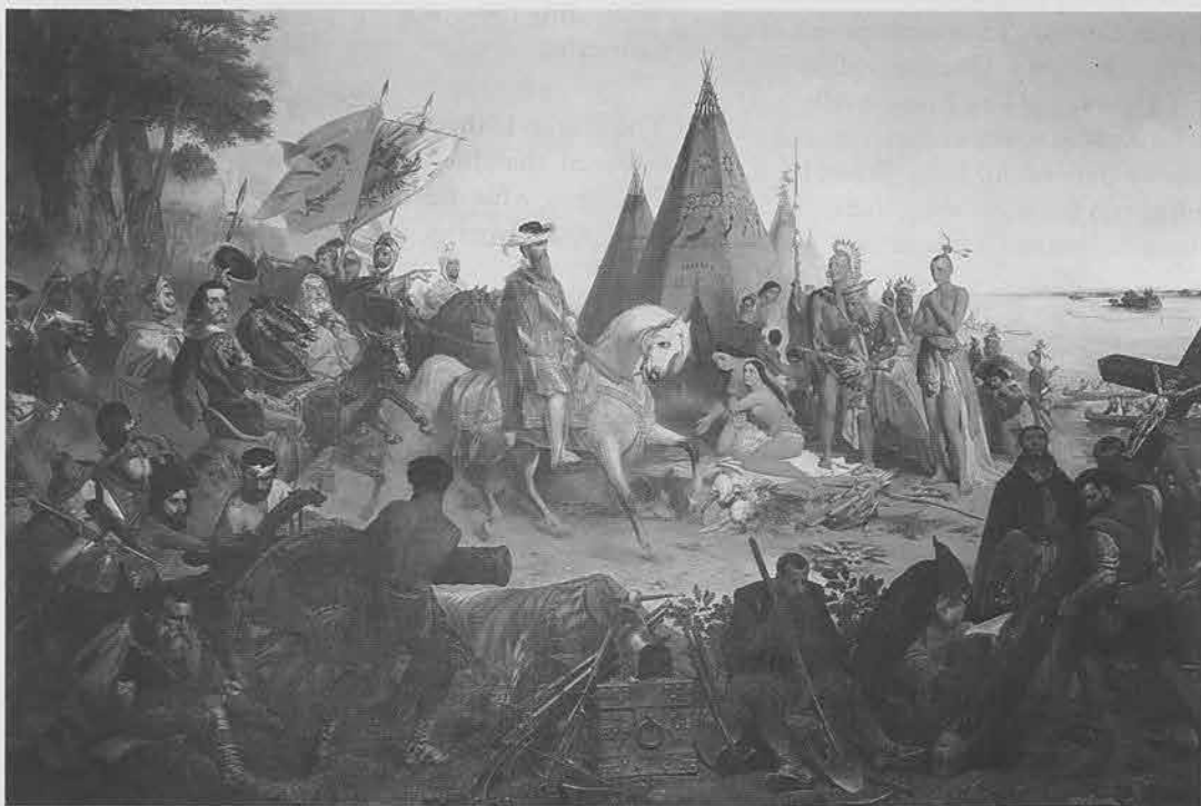
Discovery of the Mississippi, a romanticized nineteenth-century painting by William H. Powell. De Soto and his followers are shown displaying their cannon and a cross to a group of frightened Amerindians.

In the years that followed, other Spanish conquistadores took the search for gold to North America. Between 1539 and 1543 Hernando de Soto and Francisco Coronado, working separately, explored much of the southern part of what is now the United States. De Soto landed in Florida from Cuba. He led his expedition westward, discovering the Mississippi River and traveling beyond it into Texas and Oklahoma. Coronado traveled north from Mexico, searching for the “Seven Cities of Gold” that Amerindian legends said lay hidden somewhere in the desert. He never found them. But he and his men became the first Europeans to see the Grand Canyon of the Colorado River and they journeyed as far east as Kansas before returning to Mexico.