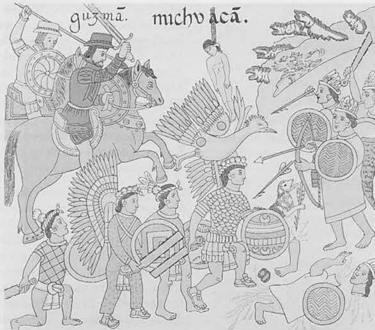
An Aztec drawing of the Spanish conquest.

America. Until the arrival of Europeans none of the Amerindian tribes knew how to make iron. And the spindle whorl was exactly like those used in known Viking lands such as Iceland.