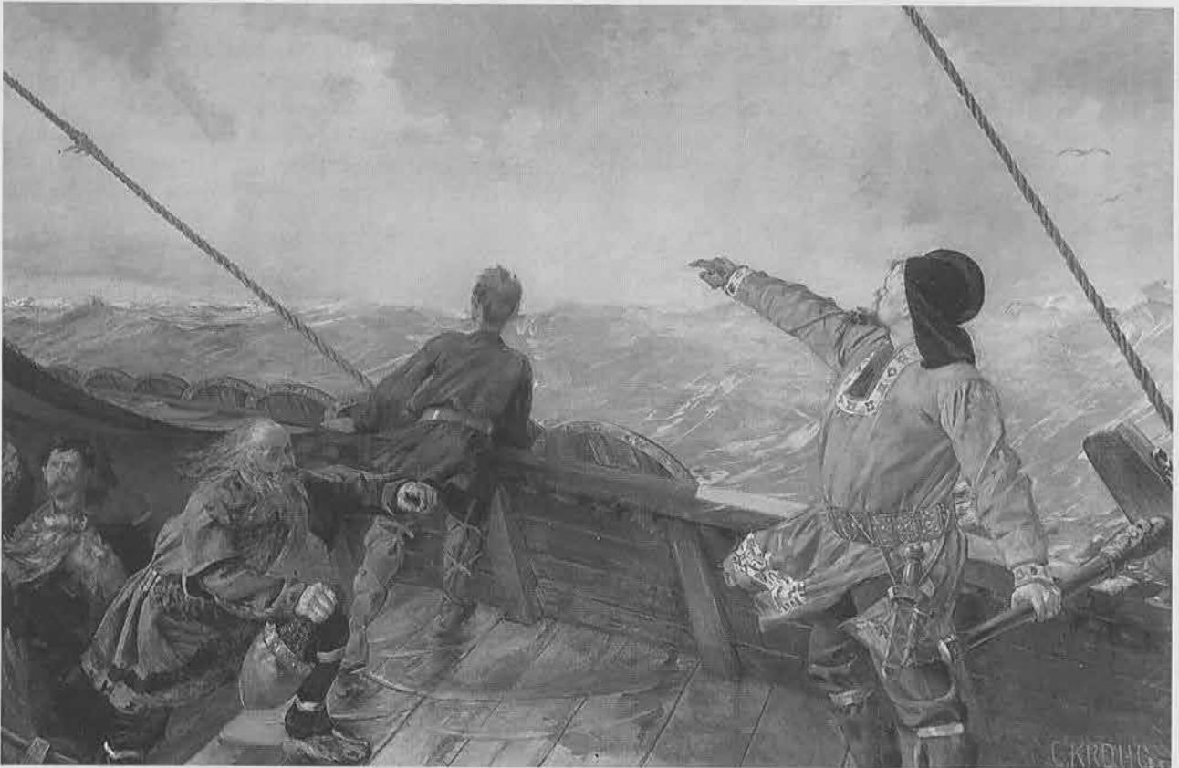
Leif Ericson sighting America. An impression by a nineteenth-century artist.

In Newfoundland the archaeologists found the foundations of huts built in Viking style. They also found iron nails and the weight, or “whorl,” from a spindle. These objects were important pieces of evidence that the Vikings had indeed reached